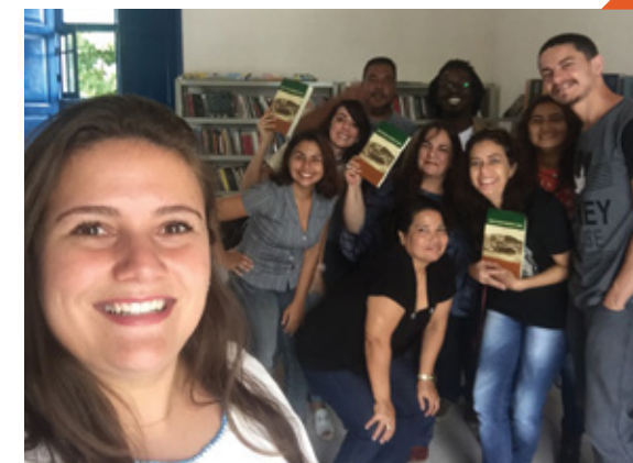
*as of January 2019, the program was renamed to Parceria pela Valorização da Educação (Partnership for the Appreciation of Education)

Most notably, the theater group of the Tapiraí Social Assistance Reference Center (CRAS) developed the project "Você é mais que uma estatística" (you are more than statistics), which promotes leadership initiatives focused on local children and adolescents. The project was among Brazil's top 11 finalists in PVE's national ranking, and one of the 40 finalists in Prêmio Criativos da Escola (Creative People in School Award), an initiative between the Alana and Votorantim institutes.